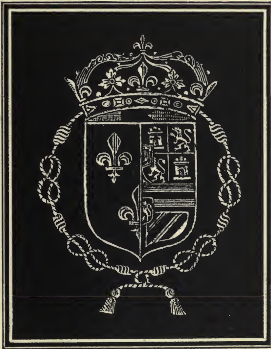
ANNE OF AUSTRIA, WIFE OF LOUIS XIII.